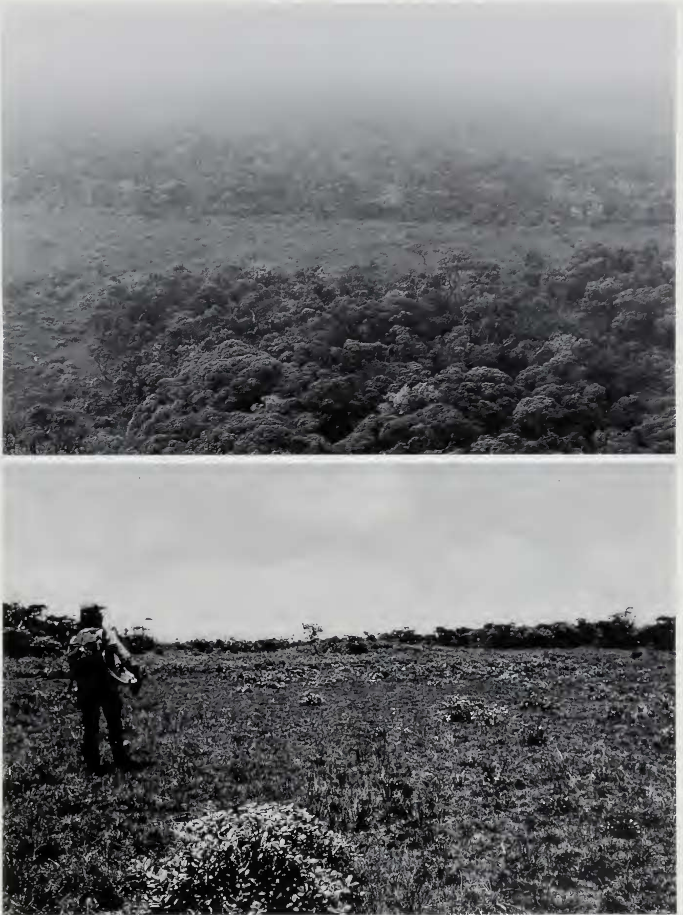
FIG. 1. Sincock's Bog as viewed from the air (upper) and from ground level (lower) with HDP in the foreground.